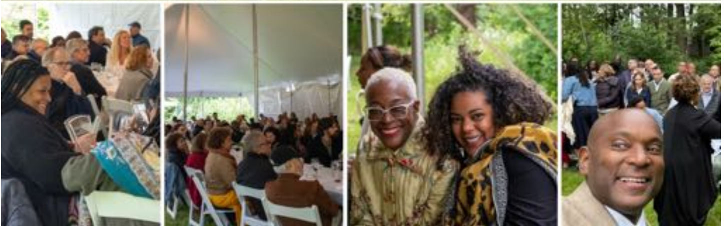
Group Photo, Introduction of the 2022 Fellows in the Arts, Supper and Live Auction