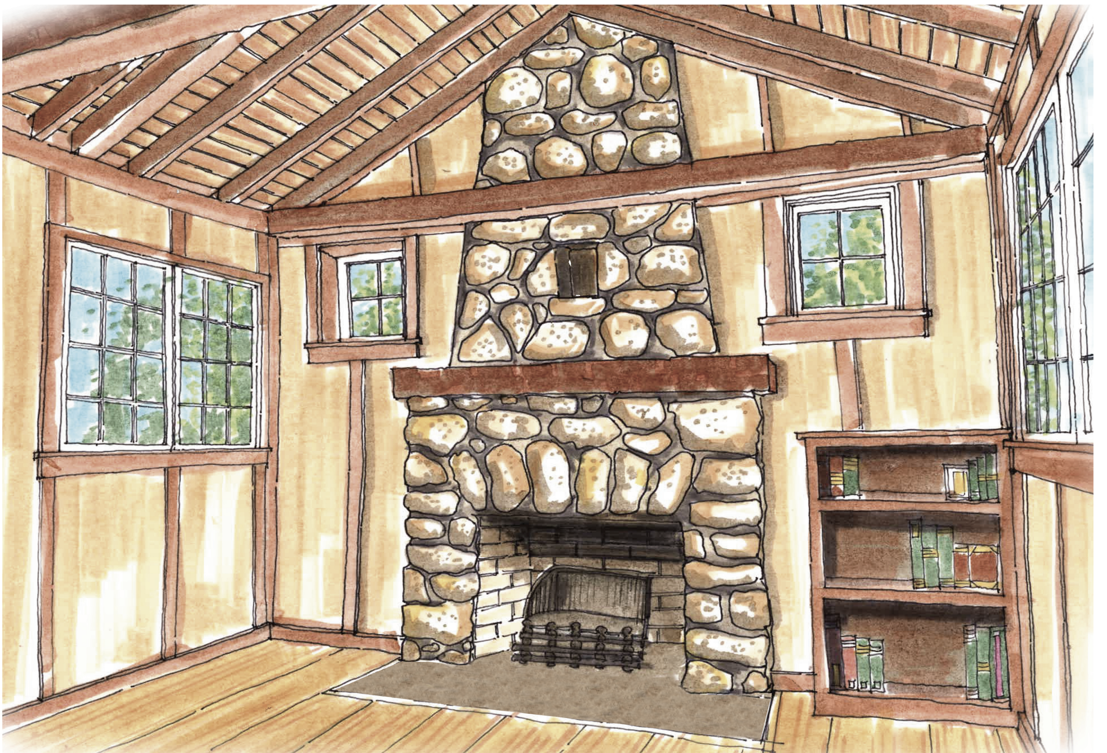
INTERIOR VIEW - of the restored space