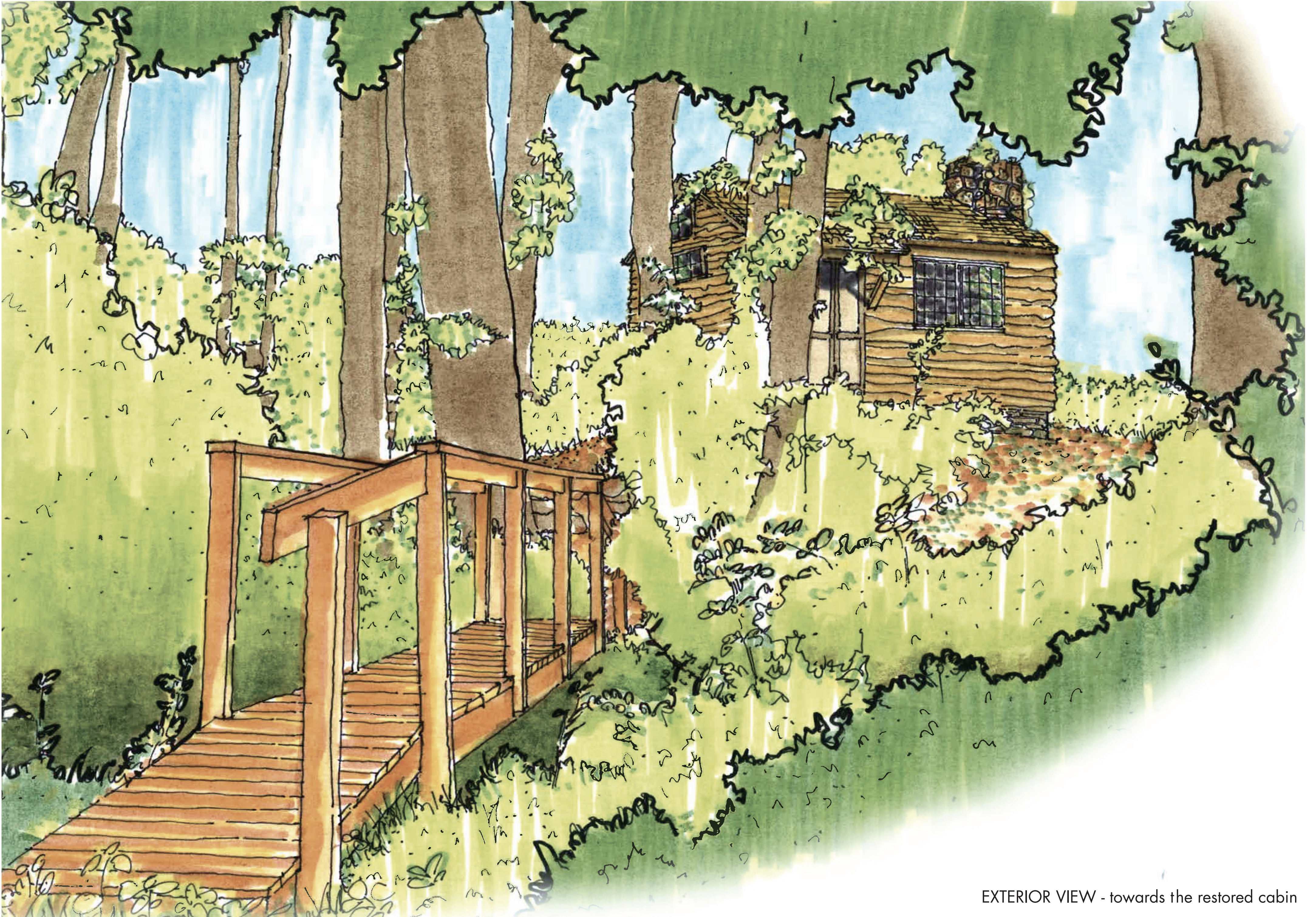
EXTERIOR VIEW - towards the restored cabin